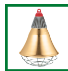
061-5167 1 intensity