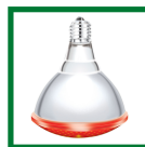
061-8623 PAR38 175 W Pkg of 2