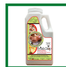
063-5781 Odour control