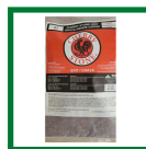
001-4534 Stone grit