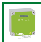
001-2734 Door motor