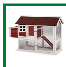
075-5465 Chicken coop