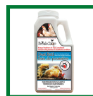
063-5790 Dust bath