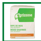
039-8385 Wood shavings

Carbon fiber bulb 001-5983 600 W 001-5984 900 W 001-5985 1200 W 001-5986 1500 W