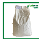
001-3760 Haying feed