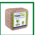
001-9434x Peck block