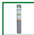
018-2304x Poultry netting