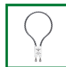
Carbon fiber bulb

Carbon fiber bulb 001-5983 600 W 001-5984 900 W 001-5985 1200 W 001-5986 1500 W