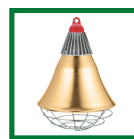
061-7855 2 intensities