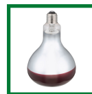
065-0902 BR40 250 W Pkg of 2