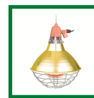
001-5980 1 intensity 11 3/4 in.