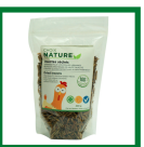
079-4604x Dried grub treats