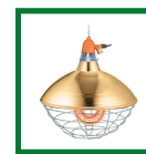
001-5981 1 intensity 15 3/4 in.