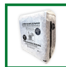
001-3024 Paper shavings